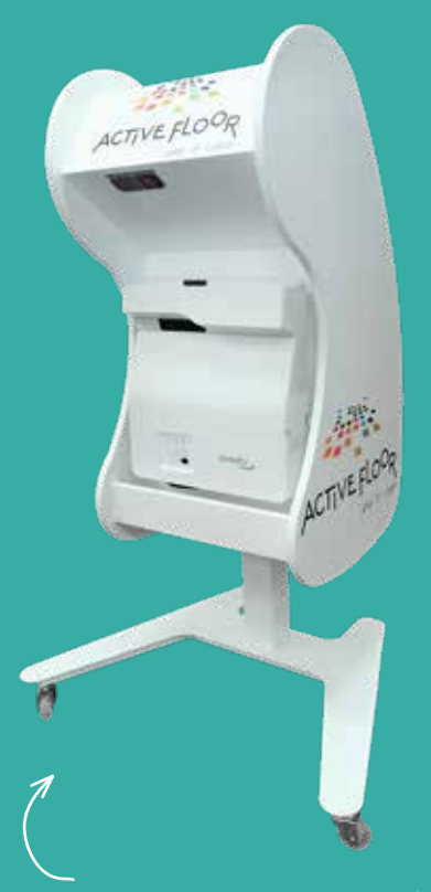
THE MOBILE MODEL THAT'S EASY TO MOVE FROM SPACE TO SPACE